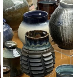
Ceramic Classes & Workshops See pages 4-6