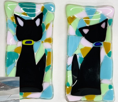
Glass Classes & Workshops See pages 12-16