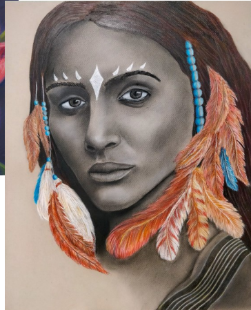
Drawing Classes & Workshops See pages 7-10