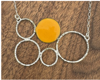
Jewelry Classes & Workshops See pages 16-18