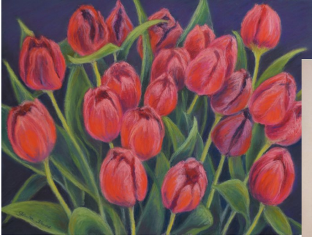
Painting Classes & Workshops See pages 21-25